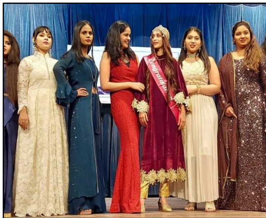
PVDT College of Education- Annual Day