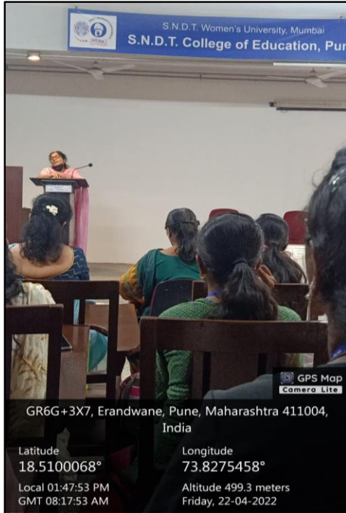
SNDT College of Education, Pune