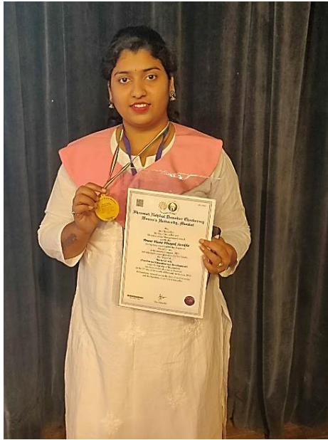
Department of Lifelong Learning & Extension- Gold Medal in MA Non-Formal Education & Development, SNTD Women's University, Mumbai