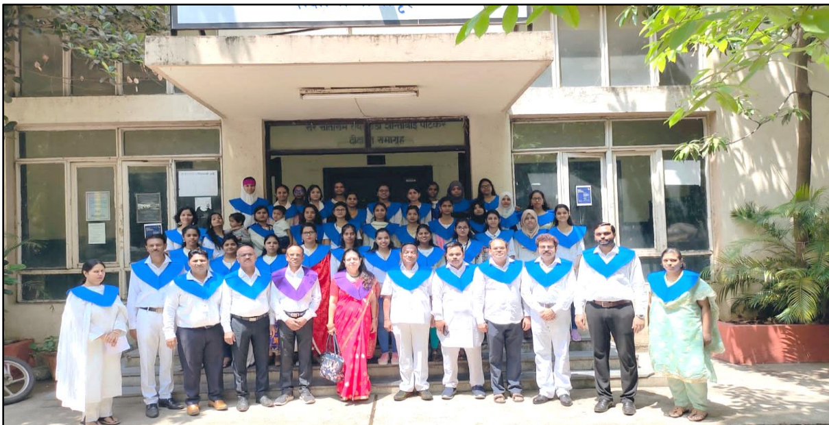
PVDT College of Education- Convocation of batch 2018-19 (07/04/22)