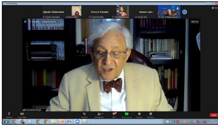
Department of Political Science- online Conference