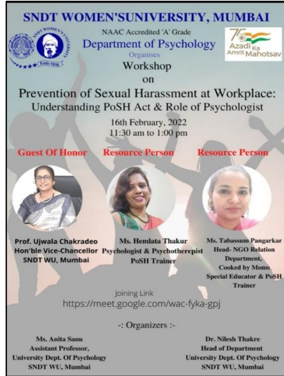
SNDT College of Education, Pune-Awareness program of sexual harassment at work place