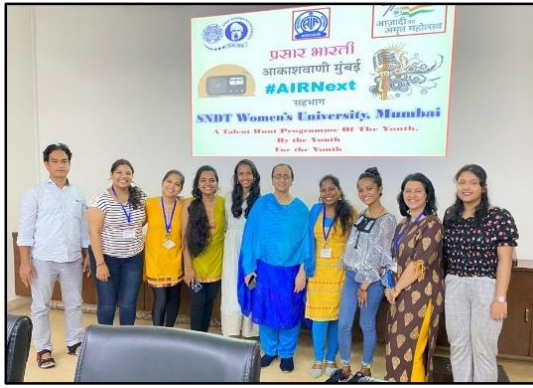
Department of Music- Air Next