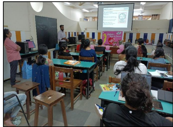
Department of Resource Management organized Menstrual Hygiene Awareness Workshop in collaboration with Unicharm India Pvt. Ltd. On March 9, 2022 to celebrate International Women's Day.