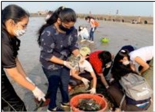
UMIT- Beach Cleaning