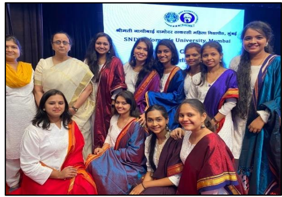
Department of Music- Air Next