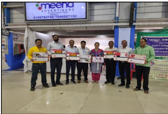
PVDT College of Education-Blood Donation Camp