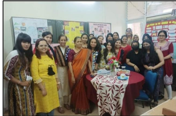
Department of Sociology-Poster Competition