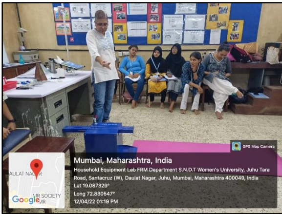
Department of Resource Management organized One-day workshop on Methodologies in Ergonomics Assessment.