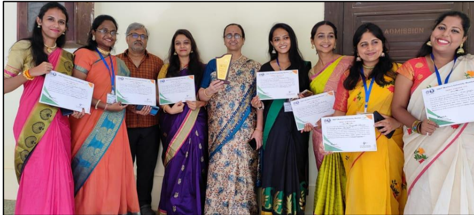
Department of Music- AIR Next