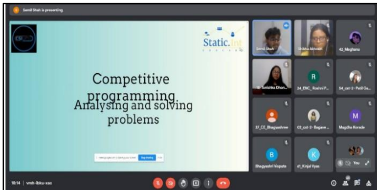
UMIT-Workshop on Competitive Programming