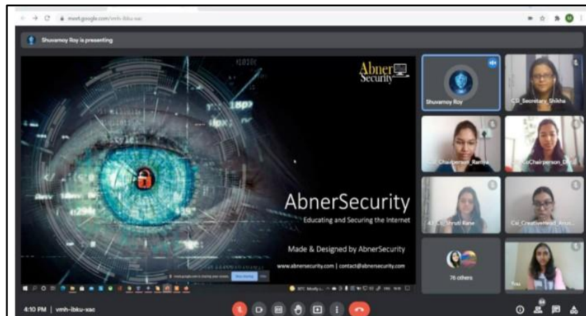
UMIT-Workshop on AbnerSecurity