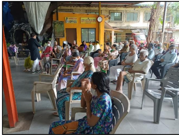
Department of Resource Management- Visit to Baba Bhaskar Vridh Ashram