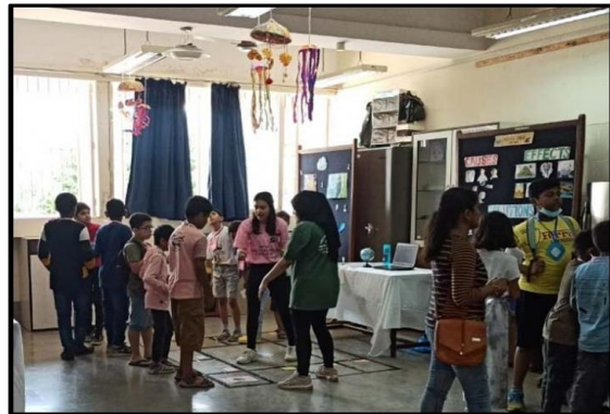
SVT College of Home Science