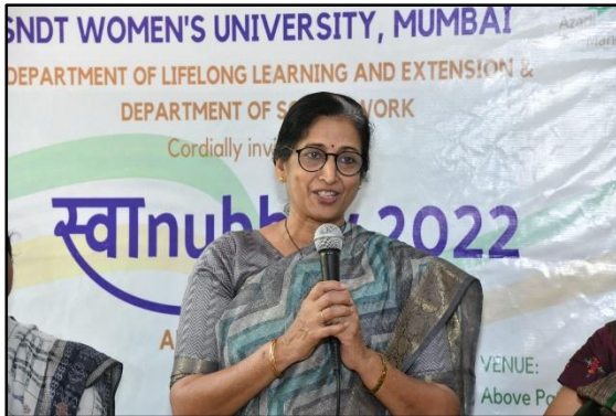
Department of Lifelong Learning & Extension-Swanubhav 2022