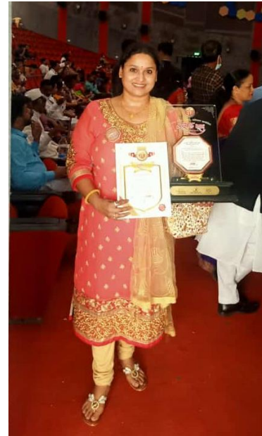
Department of Music, SNTD Women's University, Mumbai