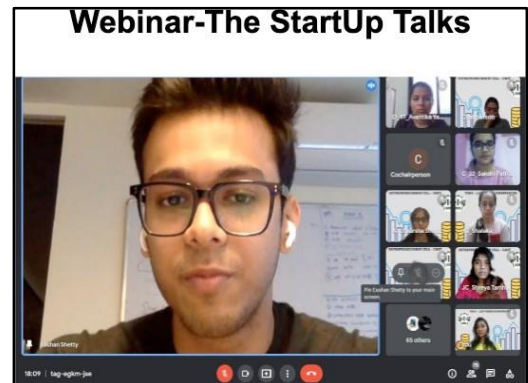
UMIT-The Startup talks