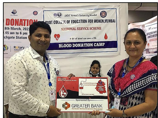
PVDT College of Education- Blood Donation